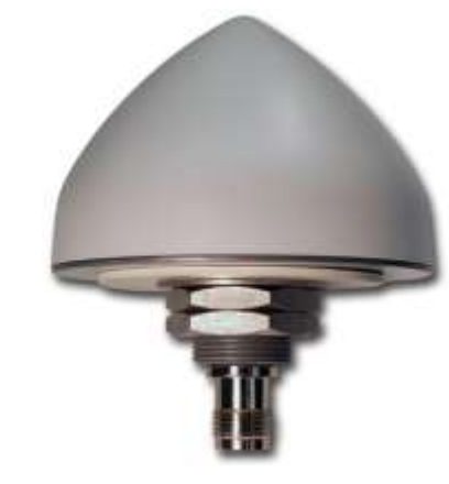
TW3370 / TW3372 Shown with Conical Radome. Low Profile Radome also available