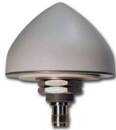
TW3370 / TW3372 Shown with Conical Radome. Low Profile Radome also available